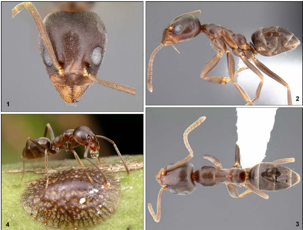
Figs. 1 - 4: Linepithema humile . (1) head of worker from Entre Rios, Argentina (specimen ID = CASENT0106983); (2) lateral view of the same worker; (3) dorsal view of the same worker; (4) worker tending a scale insect in California.

2007). In the present paper, we have documented more fully the historic spread and current worldwide distribution of L. humile , and corrected some errors in the literature.